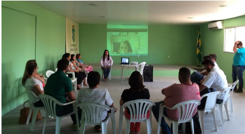
Figure 2 – Google Hangout about the ENGAGE activity in weSPOT tool for participants from the UK and 3 states in Brazil .

The European Commission has highlighted the importance of RRI in Education through its Science in Society FP7 and Horizon2020 Programme (EC, 2010; 2012). Thus, our RRI approach focuses on inclusive engagement for responsible citizenship through the discussion of key questions: “ Why do it? For what purpose and goals? Are these desirable? What are the motivations? Who could benefit and how? Who might not benefit? ” (Owen, 2015).