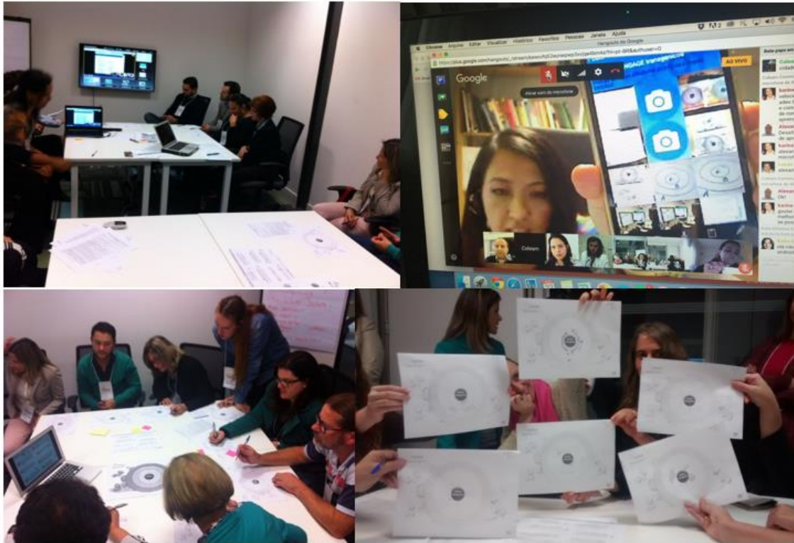
Figure 4 – ENGAGE “GM decision” game deployed with two groups of teachers in Santa Catarina. The results of the games were captured with weSPOT – PIM app.

Two key benefits were identified by the facilitators of the events, educational researchers and teachers in the three initiatives: