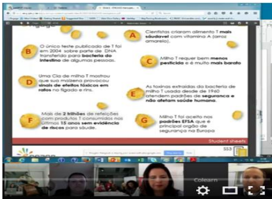
Figure 1 – ENGAGE game about GM decision Would you buy GM food? Google Hangout

Participants in the UK and in three states in Brazil (Ceará, Santa Catarina and Paraná) were 43 educators in various classrooms, 3 research-students, 4 research coordinators and 5 facilitators, who used Google Hangout, ENGAGE OER weSPOT and nQuire-it tools. Some of them used laptops and mobile phones to capture their group discussion for co-authoring posters. The video clip of the webinar is available at YouTube with 119 views (on the 30th of November, 2015).